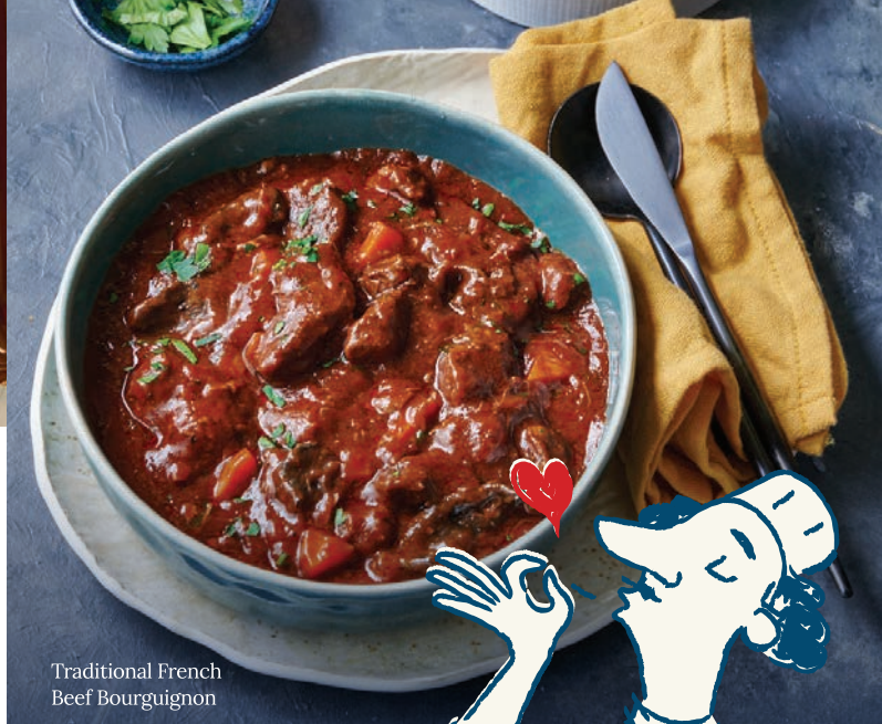
Traditional French Beef Bourguignon